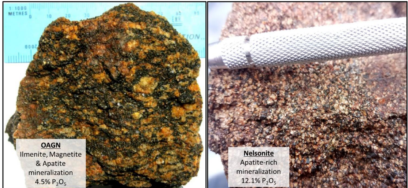
Photos: Samples taken from Foothills Project.